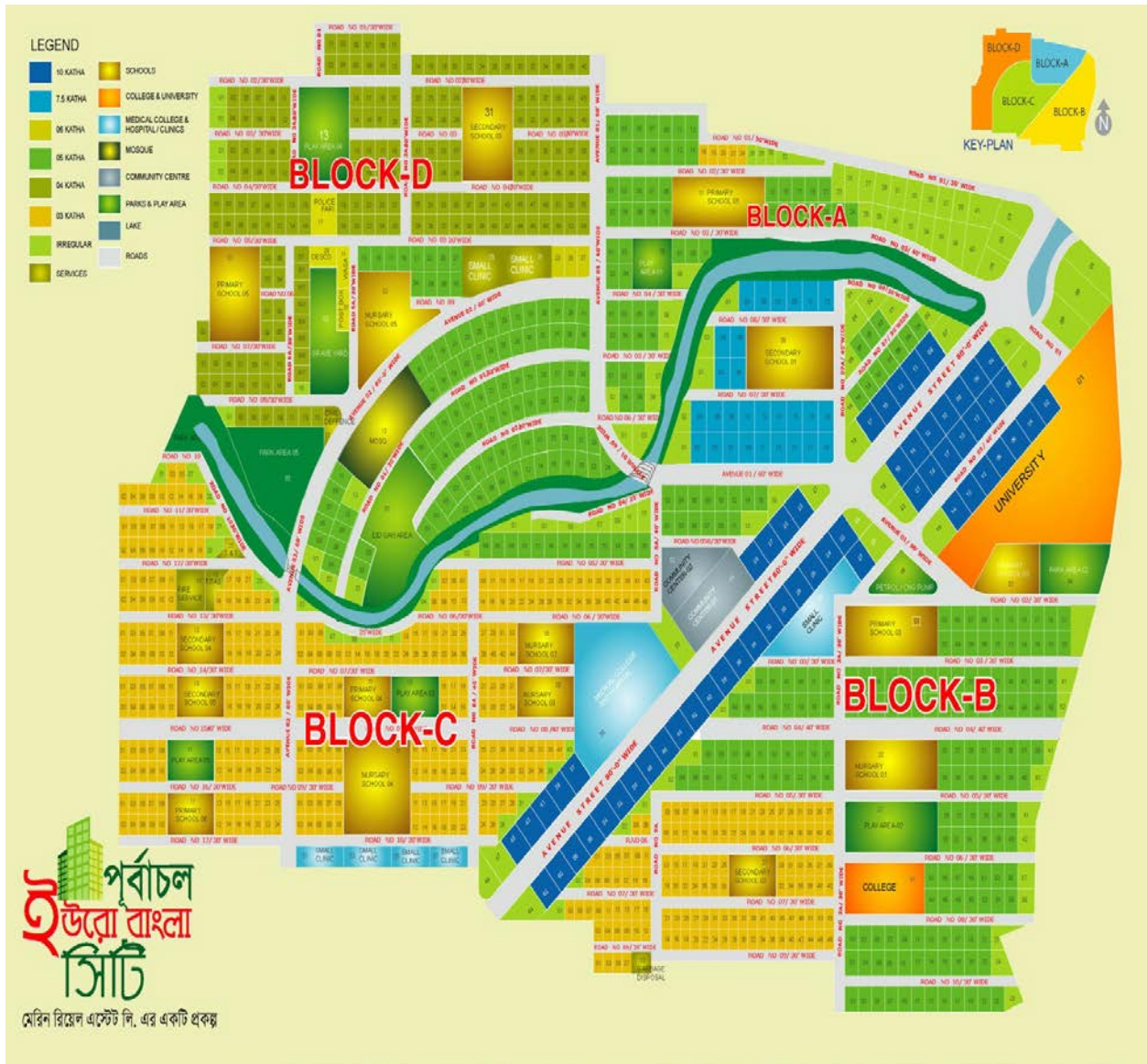
Figure1.3 Layout Plan of Marine Real Estate Ltd.