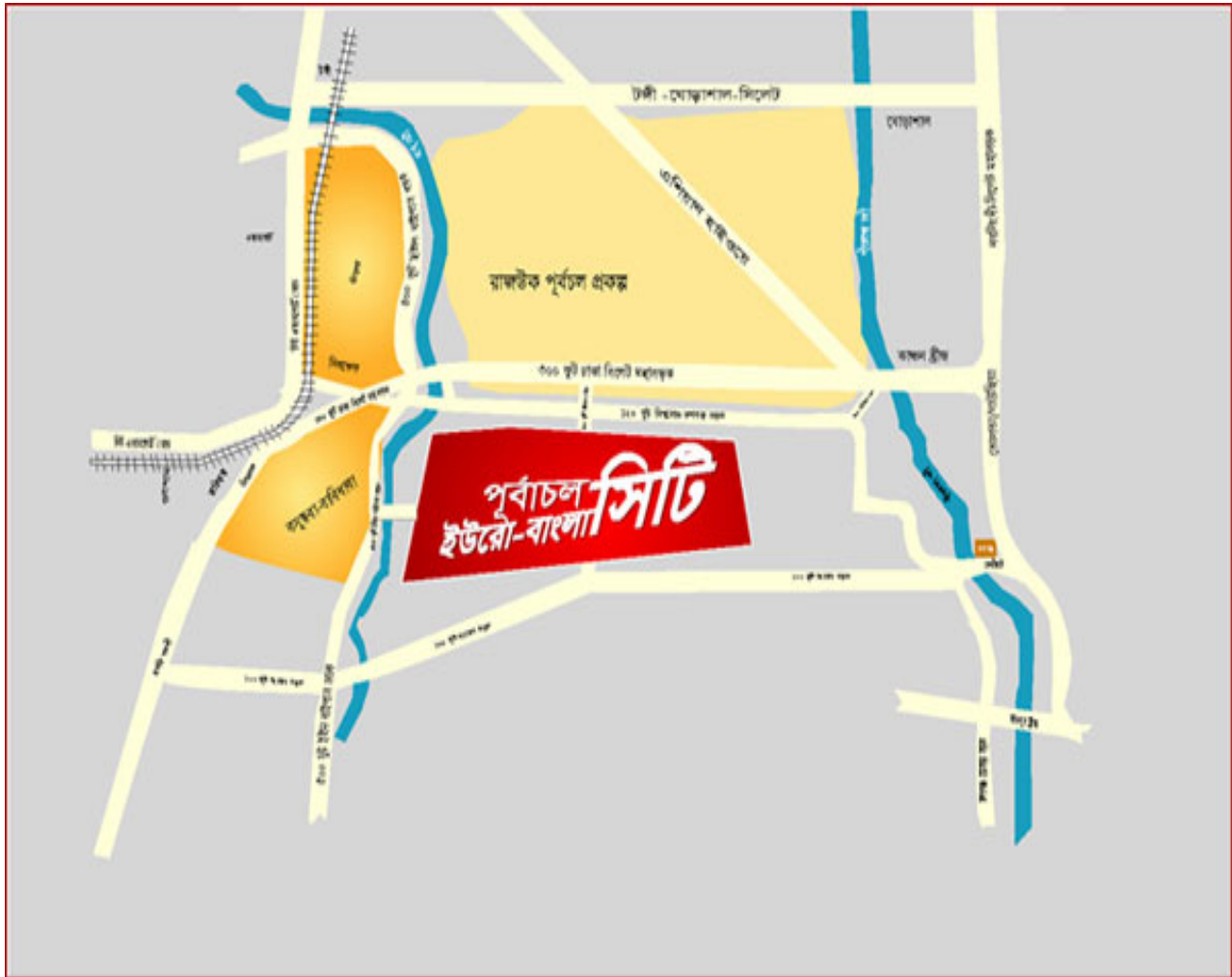
Figure 1.2 Location map of Marine Real Estate Ltd.